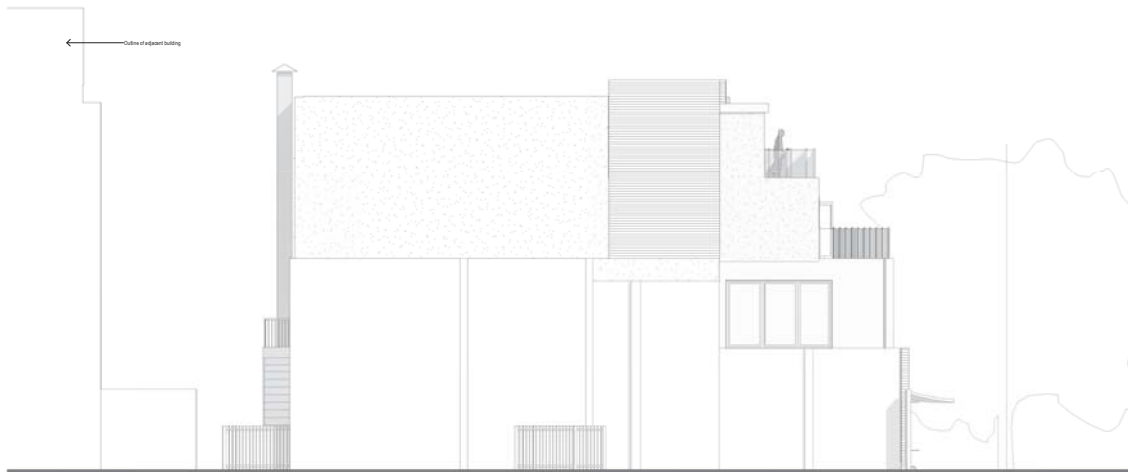
③ Proposed Elevation - South 1:100