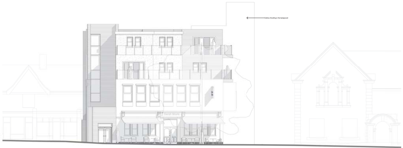
① Proposed (True) Elevation - Street Scene 1:100